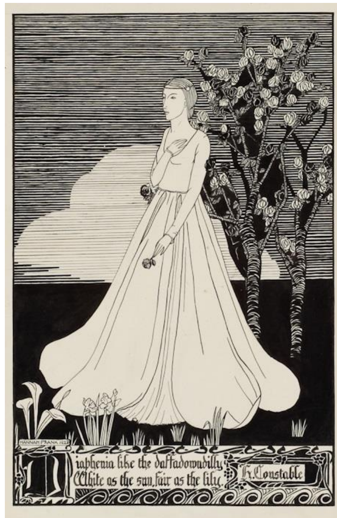
Diaphenia like the Daffadowndilly (1928)