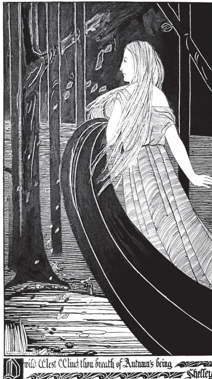
O Wild West Wind (1928)